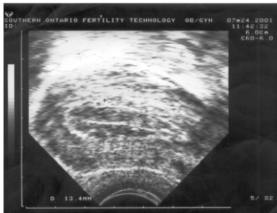
Ultrasound of a uterus, which demonstrates a triple layer endometrium of adequate

Vaginal ultrasound monitoring of monitored cycles is also be important. It is employed in spontaneous cycles on day 11 to determine how many potential eggs are developing and to ensure that the endometrium is of adequate thickness. (Vaginal estrogen may be prescribed if the lining is too thin.) Follicles that may go on to ovulate