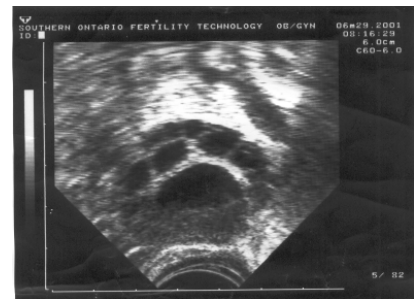
Ultrasound of an ovary with many small follicles but one central follicle, which has

ovulate in this cycle or will have an unusually long cycle. If the follicles are very large, it may mean that they are left over from the last clomiphene cycle